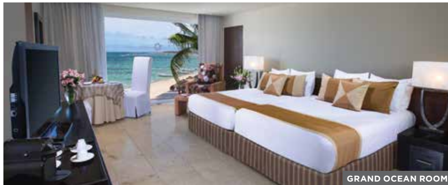
GRAND OCEAN ROOM